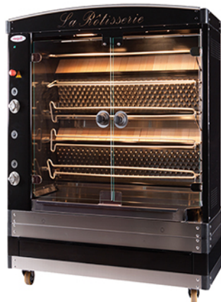
MAGFLAM 58/5 Gas only W: 58 1/4" D: 27" H: 77 1/2" (with cart) 30 to 35 chickens/hour 2 Burners - 82,000 BTU/hr (Natural Gas)