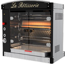
MAGFLAM 40/3 Gas only W: 43" D: 27" H: 37 1/4" (without cart) 12 to 15 chickens/hour 1 Burner - 30,000 BTU/hr (Natural Gas)