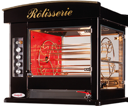
DÉCO RB 20 Electric W: 45" D: 32" H: 38 1/4" 5 Baskets - 20 chickens/hour 220 V Triphase - 9.1 Kw - 26.1 Amps