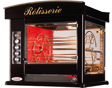
DÉCO RB 30 Electric W: 45" D: 32" H: 38 1/4" 6 Baskets - 30 chickens/hour 220 V Triphase - 10 Kw - 26.1 Amps