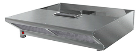
VENTLESS HOOD S4 For models N1, N2, N2 stacked and Neol W: 33 1/2" D: 32 1/2" H: 10 1/2" 220 V Single Phase - 185 W - 0.8 Amps