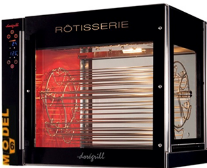
MODEL 6 Electric W: 40 1/2" D: 30 5/8" H: 37 3/4" 20 to 30 chickens/hour 220 V Triphase - 11.3 Kw - 30 Amps