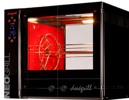
NEOGRILL N2 Electric W: 40 1/2" D: 19" H: 68 1/4" 4 Baskets - 24 chickens/hour 220 V Triphase - 9.1 Kw - 20 Amps