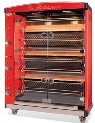
MAGFLAM 58/8 Gas only W: 58 1/4" D: 27" H: 77 3/4" 48 to 56 chickens/hour 3 Burners - 132,000 BTU/hr (Natural Gas)

CUSTOM COLORS AVAILABLE UPON REQUEST MAG AND MAGFLAM SERIES