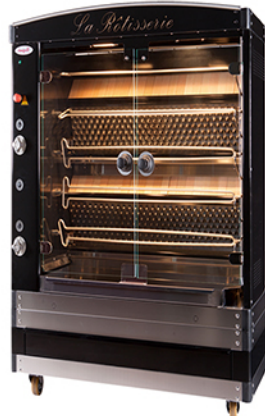
MAGFLAM 40/5 Gas only W: 43" D: 27" H: 79" (with cart) 15 to 20 chickens/hour 2 Burners - 60,000 BTU/hr (Natural Gas)