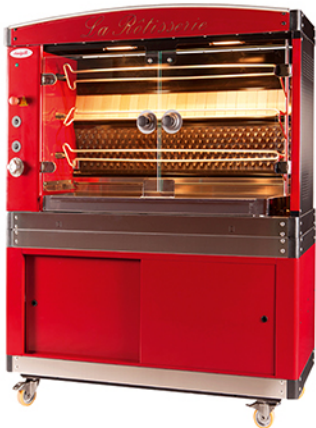
MAGFLAM 58/3 Gas only W: 58 1/4" D: 25" H: 77 1/2" (with cabinet) 18 to 21 chickens/hour 1 Burner - 41,000 BTU/hr (Natural Gas)