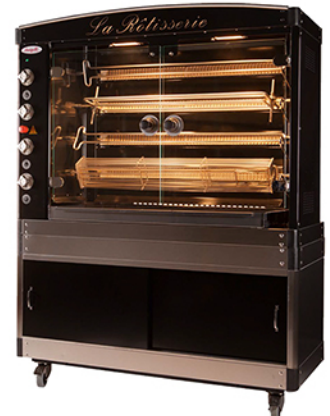
MAGFLAM 40/8 Gas only W: 43" D: 27" H: 77 1/2" (with cabinet) 24 to 32 chickens/hour 3 Burners - 112,000 BTU/hr (Natural Gas)