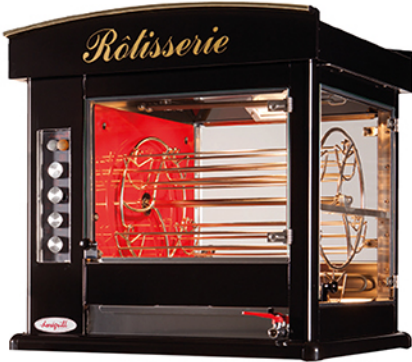
DÉCO RB 15 Electric W: 34 1/4" D: 30 3/4" H: 34 1/2" 5 Baskets - 15 chickens/hour 220 V Triphase - 6.7 Kw - 17.4 Amps