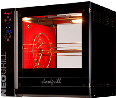
NEOGRILL N1 Electric W: 33 1/2" D: 28 1/3" H: 30 1/2" 4 Baskets - 16 chickens/hour 220 V Triphase - 7.3 Kw - 20 Amps