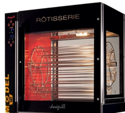
MODEL 9 Electric W: 40 1/2" D: 37 3/4" H: 43" 30 to 45 chickens/hour 220 V Triphase - 15.9 Kw - 42.1 Amps