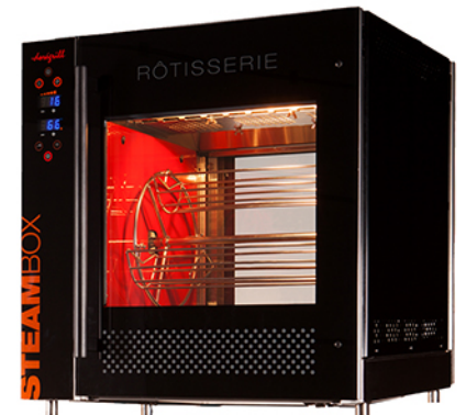
STEAMBOX Electric W: 33 3/4" D: 30 1/2" H: 35" 4 Baskets - 16 chickens/hour 220 V Triphase - 9 Kw - 20 Amps